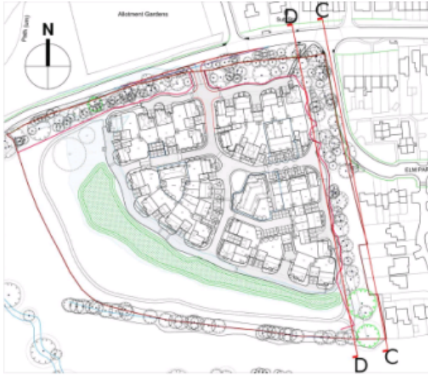
D to D