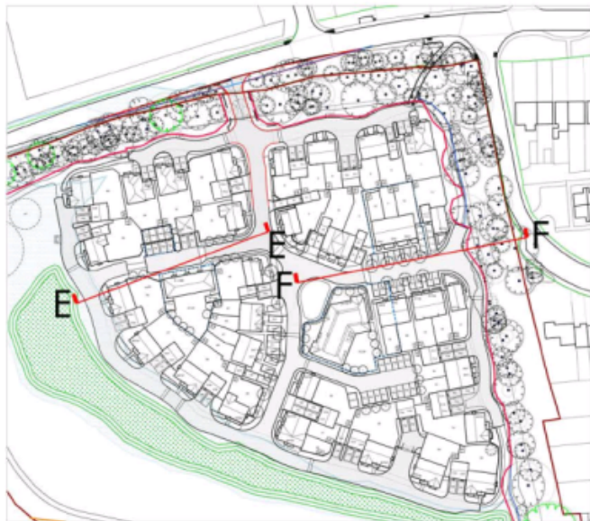
E to F