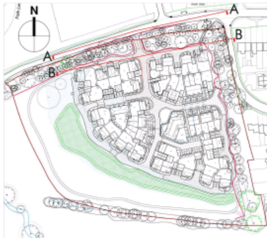
B to B